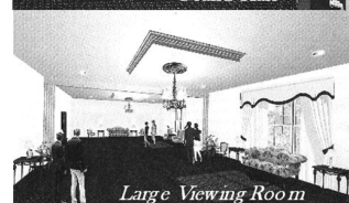
Large Viewing Room

Nativity of Our Lord and Liturgical Publications Inc. invite you to become their partner in publishing this Newsletter. Your support will permit Nativity of Our Lord to receive this service at no cost.